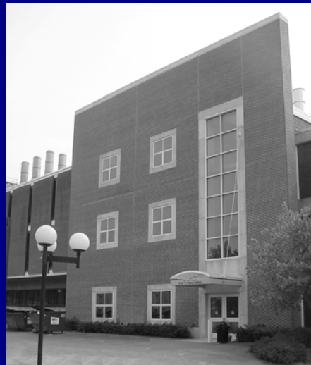
Field study site: Empire State Hall at Rensselaer Polytechnic Institute.

THE LIGHTING RESEARCH CENTER INSTALLED PROTOTYPE LED ELEVATOR DOWNLIGHTS THAT PROVIDED SIMILAR ILLUMINATION LEVELS COMPARED TO INCANDESCENT FIXTURES WHILE CUTTING ENERGY USE 45%. ELEVATOR PASSENGERS FOUND THE LIGHTING TO BE ATTRACTIVE, STYLISH, BRIGHT, MODERN, COMFORTABLE, AND CLEAN-LOOKING.