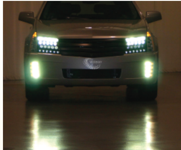
LED headlamp prototypes

Researchers measured the spectral power densities (SPD) of a representative sample of phosphor-based, high brightness LEDs suitable for use in vehicle headlamps. The chromaticity of these fall within or near the Society of Automotive Engineers' (SAE) definition of "white." Similar calculations were performed on tungsten halogen (TH) and high intensity discharge (HID) sources for comparison.