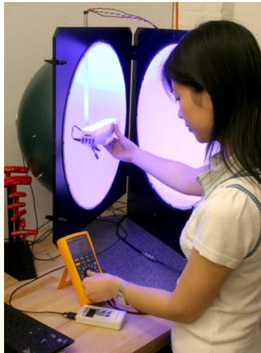
Top: An LRC graduate student evaluates an SPE-LED fixture in the sphere. Bottom: Optical ray-tracings show the paths of light exiting the SPE LED (left) and a typical LED (right).

LRC researchers have developed a scattered photon extraction (SPE) method to improve the light output and efficacy of white LEDs. The SPE method combines optimally shaped optics and placement of the phosphor away from the die. This configuration allows light traveling back toward the die to escape through the sides of the optics, generating 30 to 60 percent more light output (lumens) and luminous efficacy (lumens per watt of electricity) than typical white LEDs. At low operating currents, the new SPE LEDs are able to achieve an efficacy of more than 80 lumens per watt (lm/W). The industry's goal is to achieve 150 lm/W by 2012. Moreover, moving the phosphor layer improves LED life.