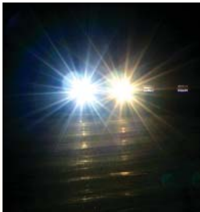
Left: High-intensity discharge (HID) lighting appears bluer. Right: Halogen appears yellower.