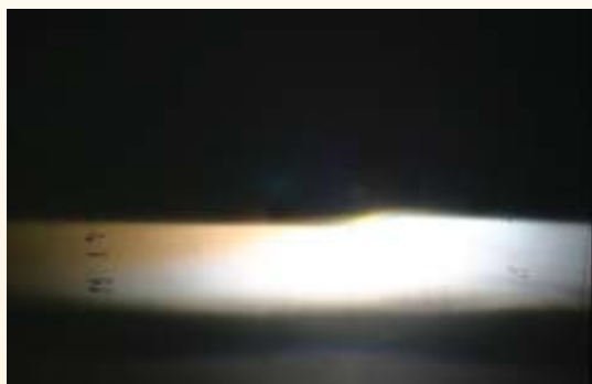
Spectrally tunable headlamp provides yellower light toward oncoming drivers (left), bluer light toward center of lane (right).

The color of LED headlamps can be readily changed.