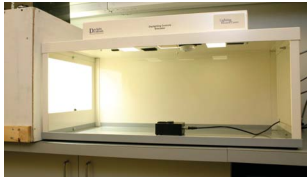
Scale model bench test apparatus