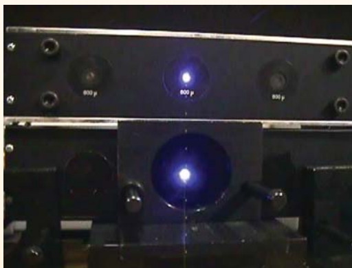
View of apparatus showing LED (top) and filtered incandescent (bottom) signal lights

The LRC conducted a study to identify the brightness/luminous intensity (B/L) ratio values for white, green, and blue LED signals (and in different LED color bins) relative to incandescent signals of the same nominal color. In a dark laboratory, subjects viewed pairs of signal lights: one LED and one incandescent. Subjects judged which appeared brighter while adjusting the intensity of the LED to randomly selected values.