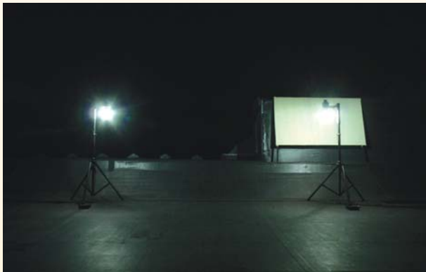
The LRC rooftop was the site of an outdoor glare experiment, studying the effect of background illuminance on discomfort.

To many, light pollution spoils the beauty of the night. However, it also wastes energy, hinders vision, disturbs sleep, and perhaps endangers wildlife. Many communities have looked for ways to reduce light pollution including restrictions on the type of luminaires allowed for outdoor lighting. Although restricting luminaires to full-cutoff over semi-cutoff types intuitively makes sense, quantitative analyses of these measures show that they have little or no effect on minimizing light pollution. What is needed is a system for characterizing light pollution that allows communities to develop enforceable limits based on physical quantities, and which can be used in available lighting software to design lighting systems meeting these limits.