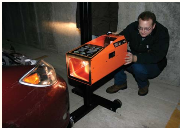
LRC researcher adjusts headlamp aim measurement equipment.

Using a modified portable headlamp aim setting device, the LRC measured the aim status of headlamps on more than 100 vehicles including some brand new ones. About two-thirds of in-use vehicles had at least one headlamp aimed improperly; nearly one-third of new cars had one or more misaimed headlamps.