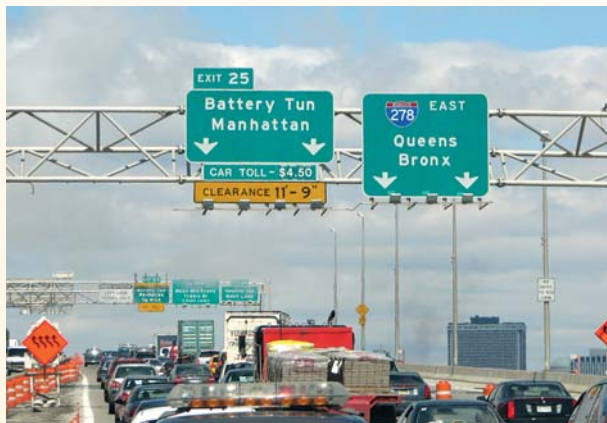
LRC researchers measured the luminance properties of actual signs in New York City.

Responding to increased energy costs of operating sign lighting systems, and to the introduction of newer materials with improved retroreflective performance, the New York State Department of Transportation (NYSDOT) worked with the LRC to evaluate the legibility of unlighted signs made from these newer