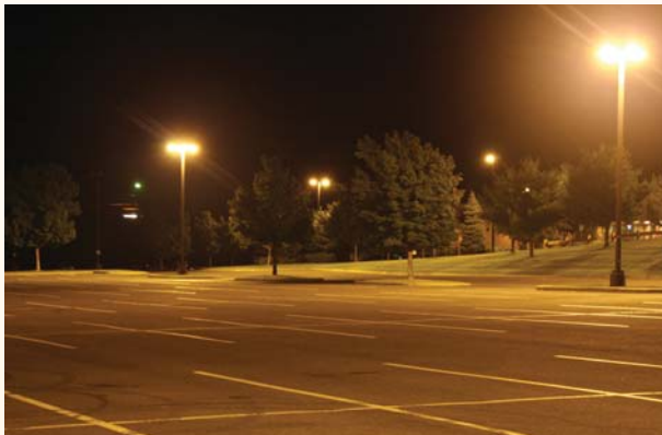
Outdoor lighting systems that provide full light output during periods of little or no occupancy waste energy.

An NLPIP survey illustrated that lighting specifiers see dynamic outdoor lighting as beneficial because of the potential for increased energy efficiency, reduced operating costs, and reduced light pollution. However, increased initial costs, increased liability, decreased safety and security and lack of technologies were perceived barriers to implementing dynamic outdoor lighting.