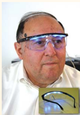
Subject wearing the 470-nm light goggles used in the experiment.

LRC researchers tested one dark control condition and six irradiances of 470-nm light. Nine subjects over 50 years old participated in a within-subjects protocol over the course of seven sessions. After one hour in dim 630-nm (red) light, subjects were exposed to 470-nm light for 90 minutes. Blood and saliva samples were collected at regular intervals for melatonin assay.