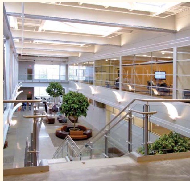
Skylights in the atrium, in addition to glass office walls, help to illuminate interior spaces. (Electric lights are on for photographic purposes only.)

The project also involved the addition of skylights to several office areas. Prismatic skylights with splayed light wells illuminate the interior spaces. Electric lighting in the daylight area was outfitted with energy-saving, daylight-harvesting equipment that can turn off electric lights when daylight provides the lighting needs for occupants.