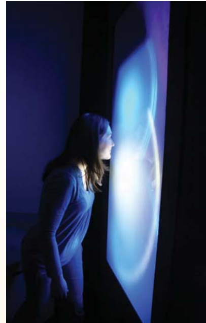
Windows LT: Light, Materials, and Dynamic Perception was an interactive exhibit demonstrating the beauty, emotion, and science of light.

The student project stemmed from the LRC's Lighting Workshop course, a research and design class integrating technology, design, policy, and communication. As part of the course, the students examine the use of light as a medium. Then they have three weeks to design and develop a "message" using lighting.