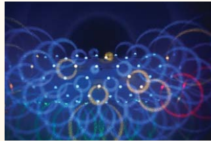
Patterns of light changed in color and shape as they were reflected through different materials and as the viewing angle changed.