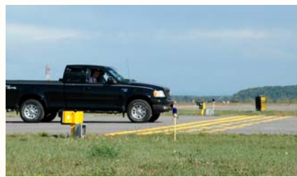
A subject is driven through the hold line while rating the LED ERGLs at the Schenectady County Airport.

In 2010, a small-scale field evaluation of LED-based ERGLs took place at Schenectady County Airport in Glensville, N.Y. This second stage of the research tested the most promising combinations found in the lab study in a full-scale field experiment at an actual runway-taxiway intersection. Under ideal circumstances, an