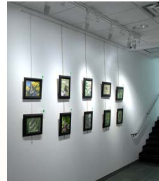
The exhibit area at the Mineola Public Library, Mineola, NY, used for the demonstration

The LRC demonstrated the LED accent lighting in a community art gallery in the basement of a public library in Mineola, NY. Existing downlights operating compact fluorescent lamps (CFLs) were compared to conventional MR16 track heads and the WAC LED track light. A site evaluation was performed by an independent evaluator.