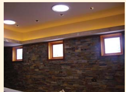
Linear LED cove