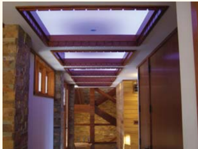
Soft colors transition above light decks