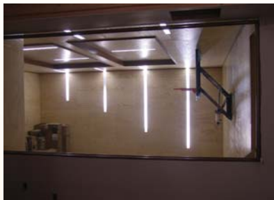
Continuous lines of light provide an interesting view from the living area to the 14'-0" ceiling height of the basketball court in the lower level; regressed lens linear fluorescents eliminate risk of balls hitting surface-mount fixtures, which are a typical gymnasium lighting solution.

LRC DesignWorks created design solutions for a Frank Lloyd Wright-style home, utilizing energy-efficient lighting to enhance its architecture, provide the warm glow characteristic of FLW homes, and reinforce its sustainable message.