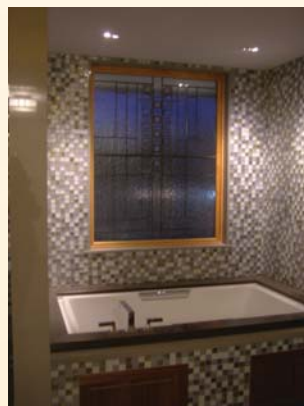
3W LED adjustable accents on glass tile walls in bath area