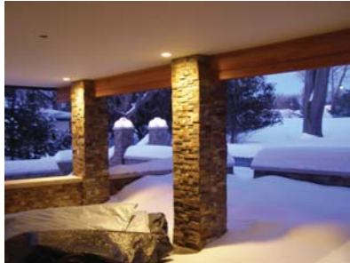
12W LEDs downlight stone columns