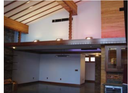
LED downlights inverted in custom 'planters' to uplight ceiling