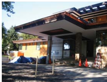
Custom home near Syracuse, NY — sustainability is a priority, from materials to lighting.