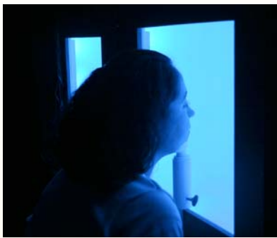
Subjects were exposed to 50 minutes of 470 nm “blue” light every four hours throughout the 27-hour sessions.

Studies have shown that light can affect biomarkers, performance, and subjective sleepiness; however, these effects are not very well understood. The effect of light on biomarkers was examined in a preliminary study. The goal of this study was to better understand the role of short-wavelength (“blue”) light on subjective sleepiness and performance over 27-hour sessions, with and without sleep.